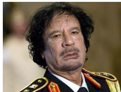
"What? You mean I can't play Hide and Go Seek forever? Why?!!!" Cheer up, emo kid.

Libyans are rioting in happiness now as they enjoy their new freedom with regards to the no longer alive Gaddafi "Oh joyous day, how great it is to lose our dictator. Now we just have to wait 3 years for a new one to come in and ruin our lives all over again. I for one cannot wait," said one Libyan. Truly a remarkable story. 🙄