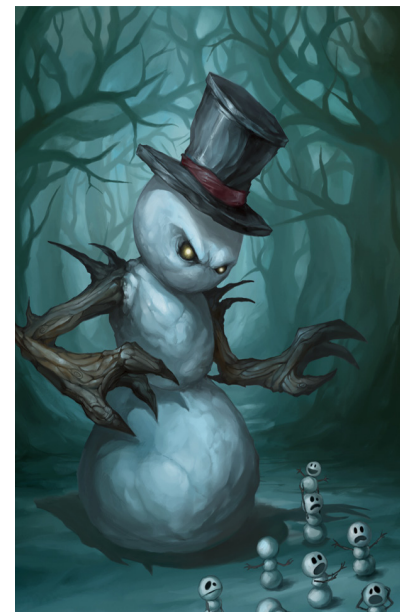
Frosty, the snowman. Who's heart was made of souls!