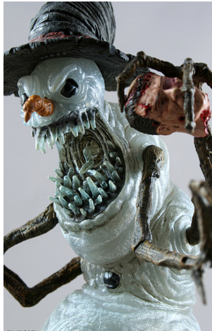
Yeah, I would kill myself too if I had this to look forward to. Wouldn't you?