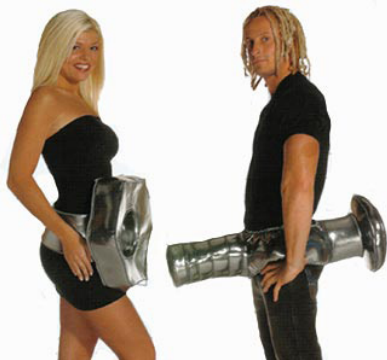
I wonder if he gives a good screw, but she's got to be nuts if she can handle THAT.

a slutty engineer, even slutty computer science major, slutty cartoon characters, and for certain, a slutty optimus prime... any kind of career orientated costume can certainly be made for lack of better words, slutty. Getting creative is another con to our list: if you can make Dora the explorer slutty, I feel like you're winning. Halloween-end is soon approaching what are YOU going to be?